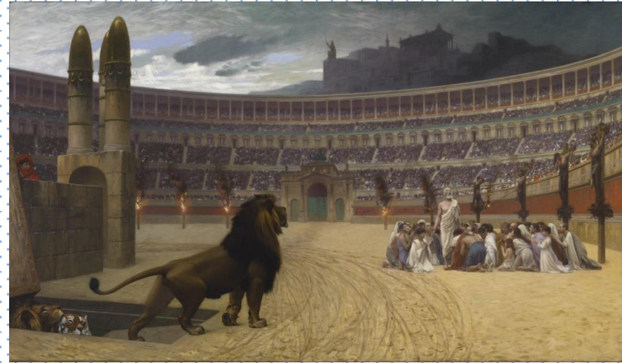
Martyrdom of Polycarp in AD 153.

86 years have I served Christ he has never done me wrong, how can I blaspheme my king and my saviour.